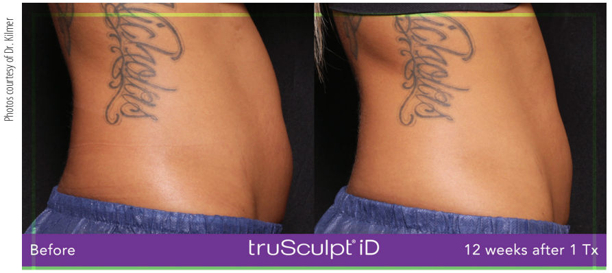
FACE + BODY AESTHETIC SOLUTIONS by CUTERA